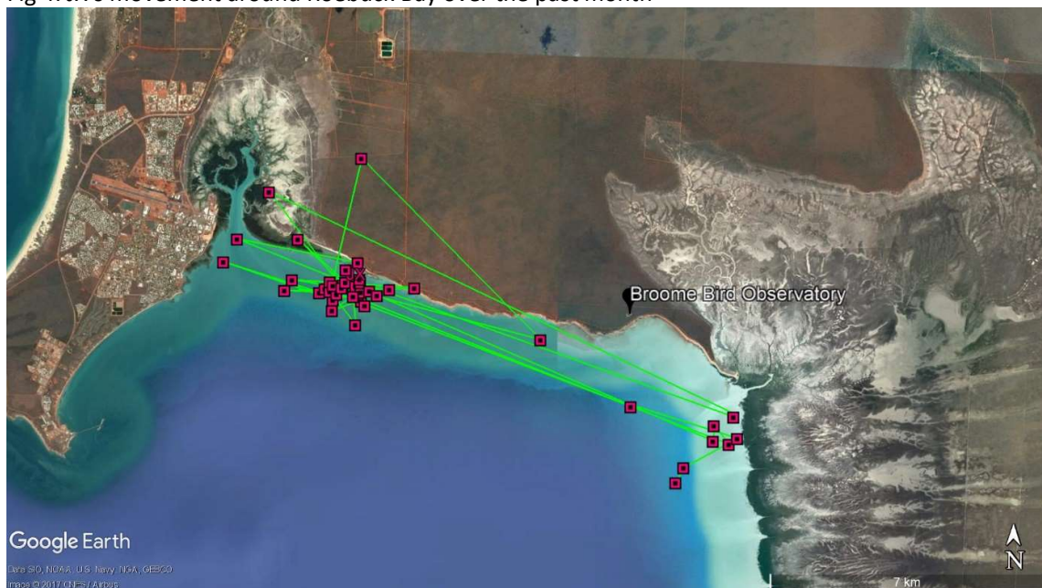
Fig 4: JX's movement around Roebuck Bay over the past month

Meanwhile, JX and LA are still doing very well at Roebuck Bay and Eighty Miles Beach respectively. At Roebuck Bay, JX regularly utilizes the Dampier Creek, West Quarry and the saltmarshes south of Crab Creek. Amazing that it has managed to escape from birders' eyesight since August. On the other hand, at Eighty Miles Beach, LA remains at its favourite patch of the beach 40-50km south of the Anna Plain station entrance.