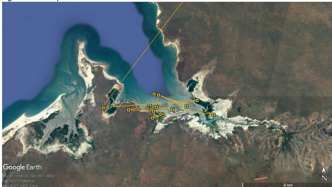
Fig 2: KU at Dampier Peninsular

Instead of heading back to Roebuck Bay in Broome, KU chose to stopover at Dampier Peninsular near Beagle Bay. It would be very interesting to see if it will finally come back to Roebuck Bay later in the season.