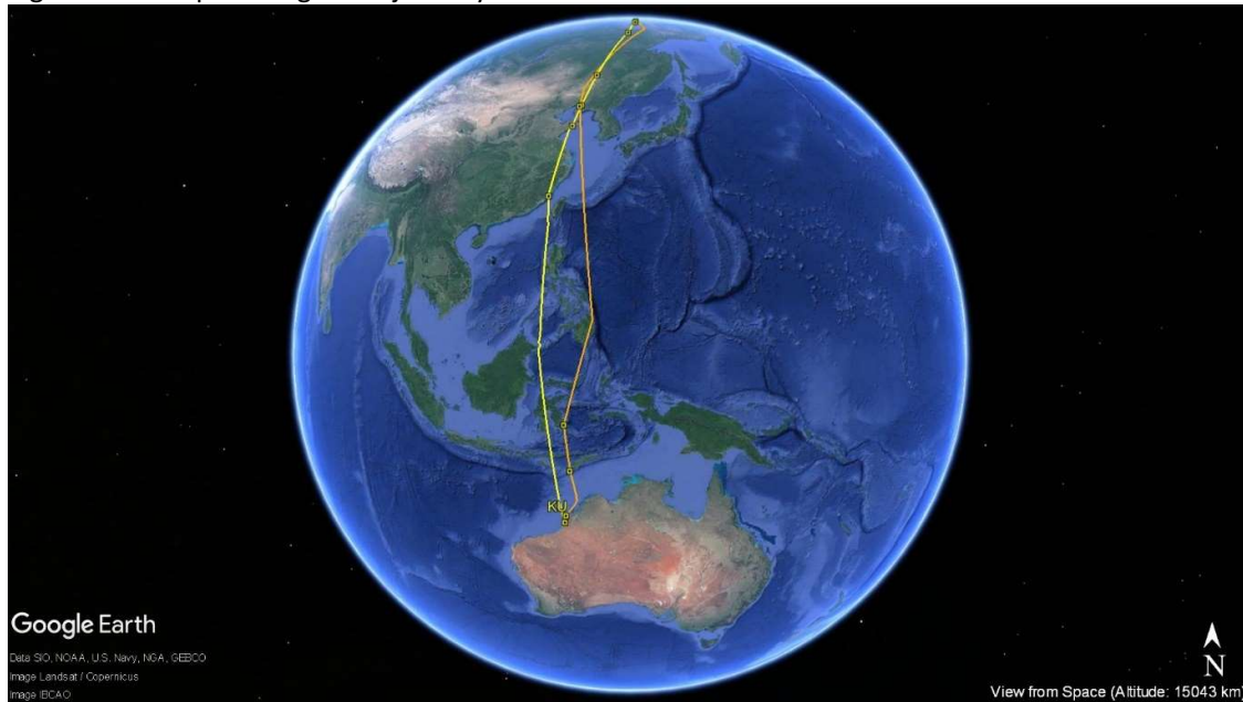
Fig 1: KU’s complete migration journey

Instead of heading back to Roebuck Bay in Broome, KU chose to stopover at Dampier Peninsular near Beagle Bay. It would be very interesting to see if it will finally come back to Roebuck Bay later in the season.