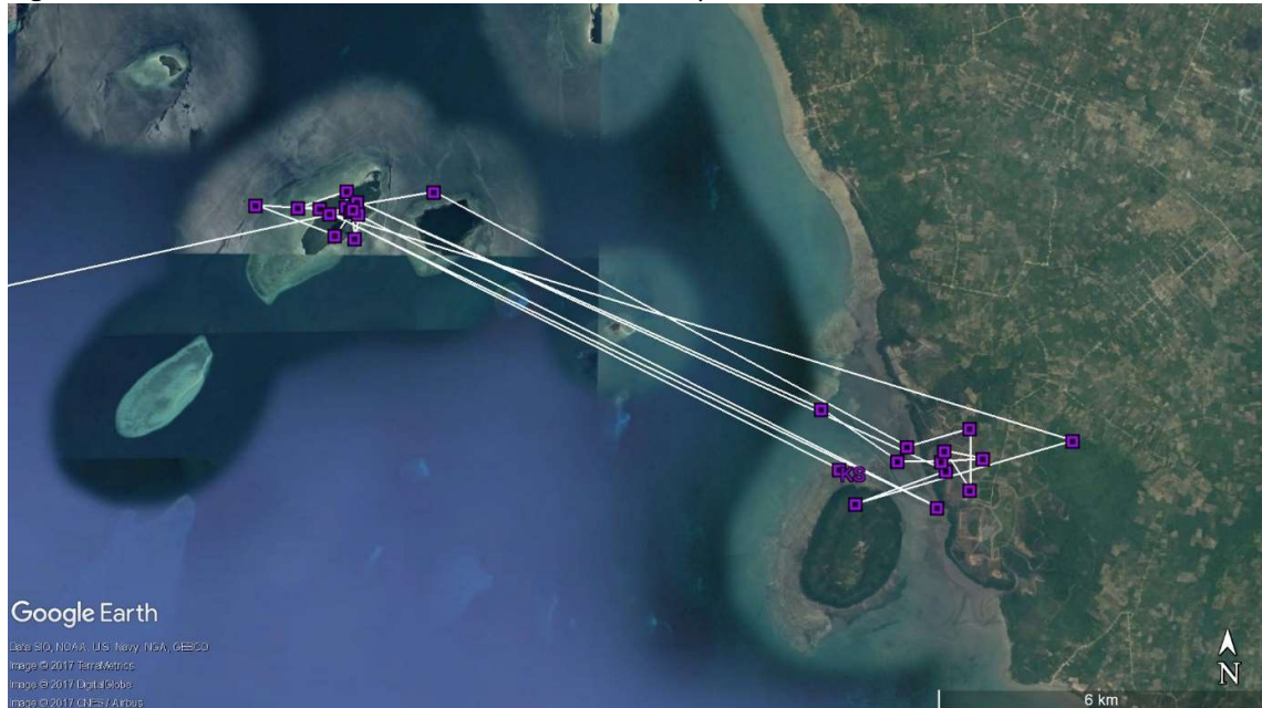
Fig 3: KS's movement between reefs and farmland in September at SE Sulawesi

Meanwhile, JX and LA are still doing very well at Roebuck Bay and Eighty Miles Beach respectively. At Roebuck Bay, JX regularly utilizes the Dampier Creek, West Quarry and the saltmarshes south of Crab Creek. Amazing that it has managed to escape from birders' eyesight since August. On the other hand, at Eighty Miles Beach, LA remains at its favourite patch of the beach 40-50km south of the Anna Plain station entrance.