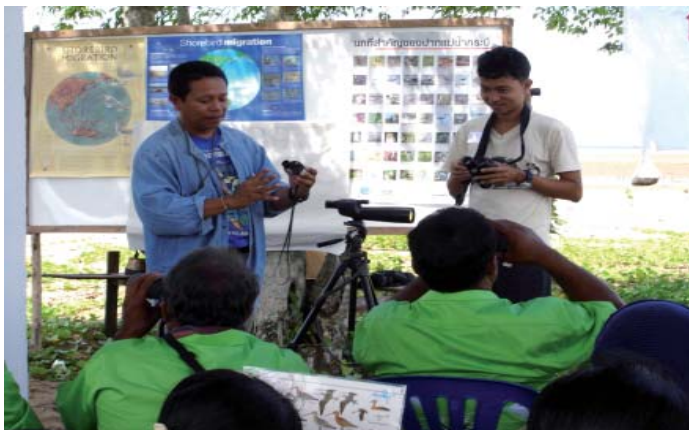
Community training workshop on "Conservation of Shorebirds and Wetlands" at Krabi Estuary and Bay, Thailand on 17, 18th June