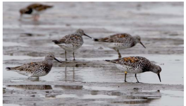
Great Knot

In order to raise awareness of the impacts of reclamation on shorebirds the SSMP data for 2006 has already been made widely available, in both Korean and English, on websites (such as those run by Birds Korea at http://www.birdskorea.org ) and in published accounts, with a fuller report underway. In addition, an international workshop is planned in Seoul for September 2006, and counts will be repeated in spring 2007 and 2008