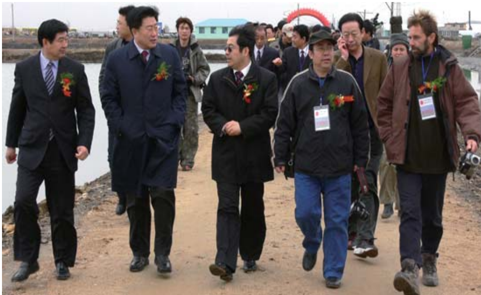
The Mayor of Dandong (2nd from left) with representatives from Yalu Jiang National Nature Reserve and Miranda Naturalists Trust.

We visited the Gushan High School as we had done in