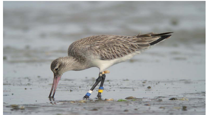
A colour-banded godwit photographed in Japan 11 days after being last seen in New Zealand.