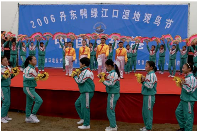
School children performing at the Yalu Jiang Birdwatching Festival.