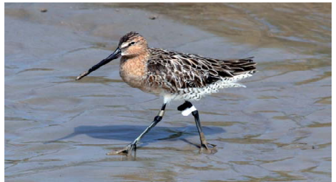
Asiatic Dowitcher with black over white flag combination