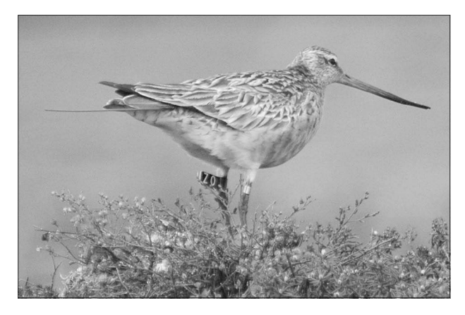
Godwit ZO on the breeding grounds